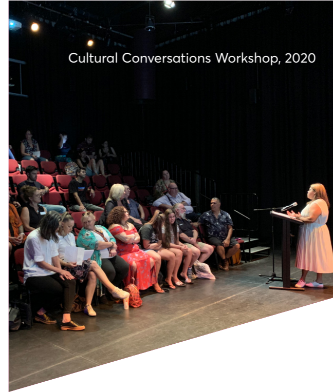
Cultural Conversations Workshop, 2020

The findings of this report strongly support the notion that more work is required to facilitate and support the expression and development of First Nations and cultural practices within Parramatta.